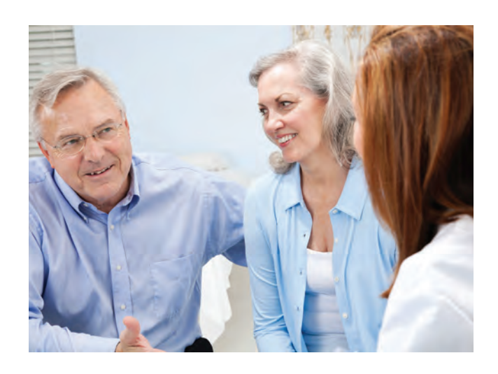
The strategy is to keep the customer coming back.

The idea is emerging in different ways. For example, VetXpress, with two clinics in Virginia, offers free vaccines for life to encourage clients to visit regularly.